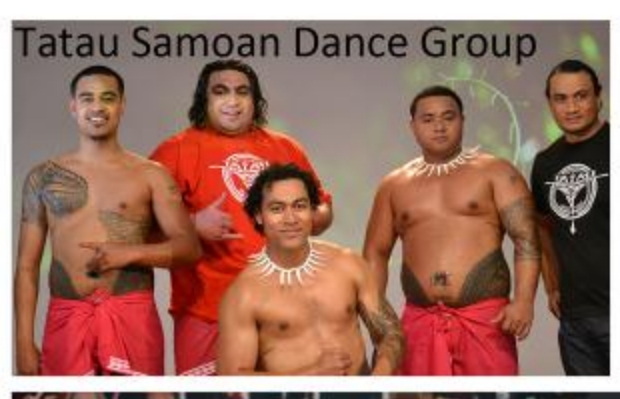
Cultural Week 2013